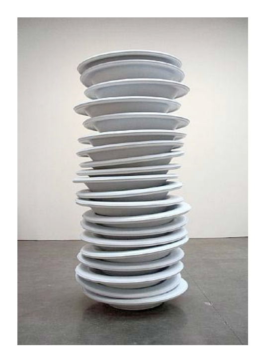
CompSci 100e, Spring2011